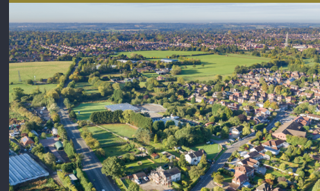
Former Wyevale Garden Centre