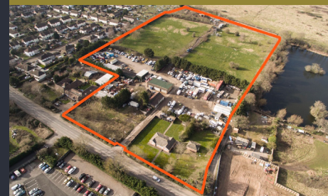
Commercial to residential land