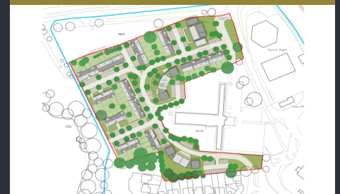
Edge of town infill site